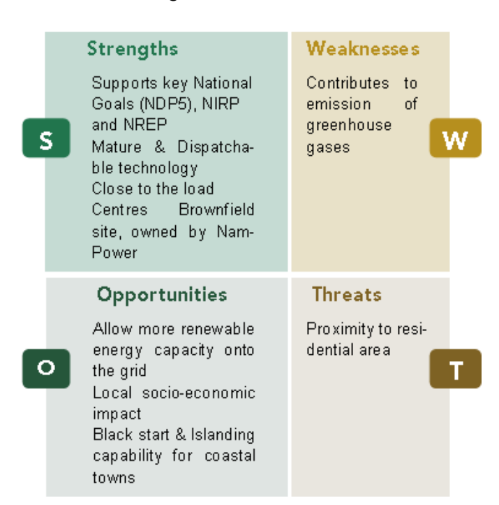
Figure 1: Project SWOT Analyses

The Strengths, Weaknesses, Opportunities and Threats (SWOT) analysis for the Project are summarised in Figure 1.