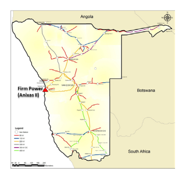
Figure 2: Project Site location

NamPower's Walvis Bay site is situated on the border of an industrial area, adjacent to the recently constructed Bulk Fuel Storage facility.